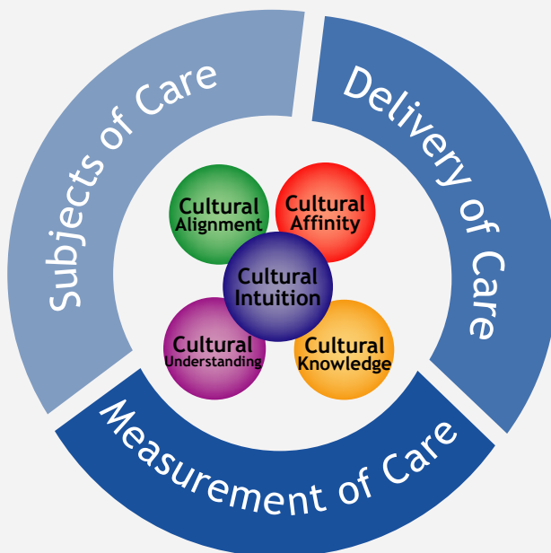
Figure 3. Cultural Domain Acuity Model (CDAM™)